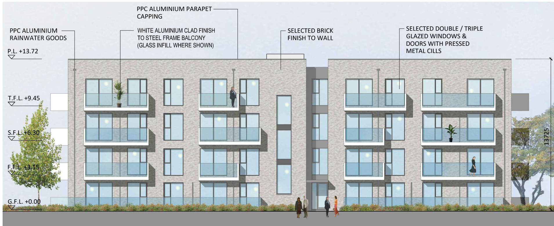
Front Elevation (Street Elevation) scale 1:200